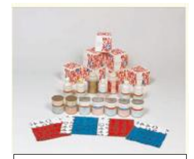
Yoshimi Okuda, "Eva's", 1966

The Otani Memorial Art Museum, Nishinomiya City will hold the third installment of its exhibition series, "Nishinomiya Otani Memorial Art Museum Exhibition & Collection 3," which looks back on the museum's history from the