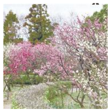
You can enjoy more than 40 kinds of red and white plums ( about 200 trees ) mixed by over 100 years old ones.